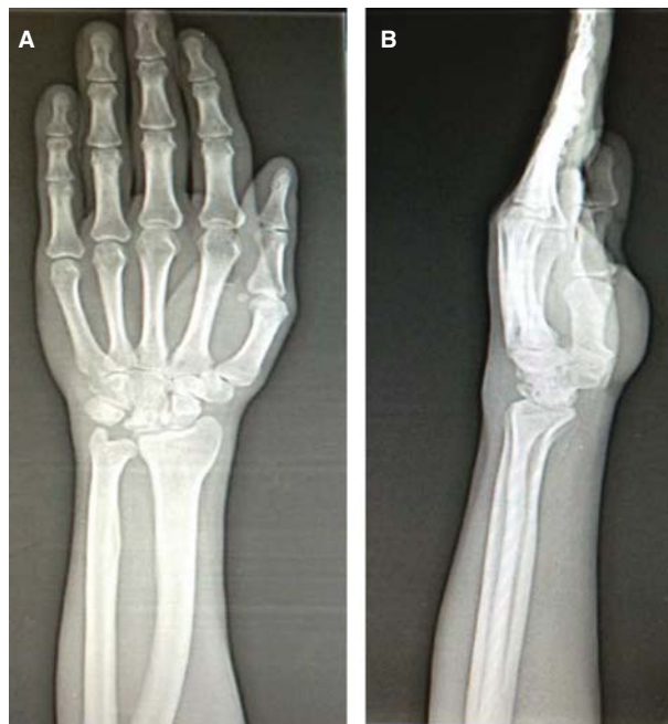
Figure 4. X-rays at second year of the operations showing the lunate to be in reduced position but has been collapsed (a and b).

was successfully reduced. After anatomical reduction was achieved, fixation was applied using K-wires. A fluoroscopic control revealed normal carpal bone relationship, and both volar and dorsal capsules were repaired (Figure 2). A short arm cast was applied for 8 weeks. Three months postoperatively, all K-wires were removed, and physiotherapy