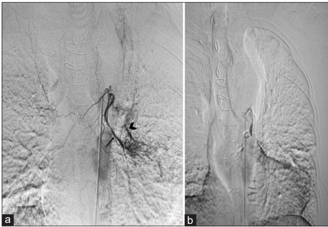
Figure 2: (a) Digital subtraction angiography of the left bronchial artery shows the presence of abnormal communication between the left bronchial artery (arrow) and left lower lobe branch of the pulmonary artery (arrowhead); (b) Post embolization image shows no filling of the abnormal communication

increased hemodynamic stress in bronchial artery due to associated bicuspid aortic valve and thoracic aortopathy.