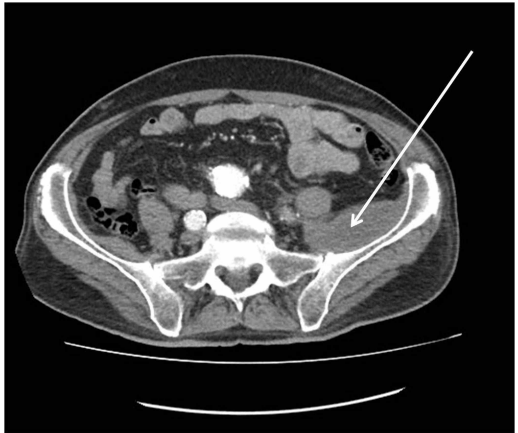
FIGURE 3: CT scan performed two months post-discharge revealing absorption and a significantly reduced in size haematoma (arrow).