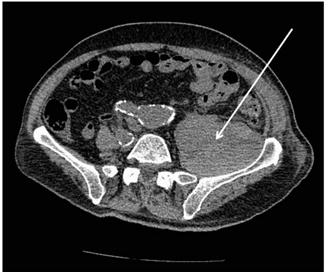
FIGURE 1: CT scan revealing a left iliopsoas haematoma (arrow) on day of admission.

The patient was admitted to the hospital, and warfarin anticoagulation regimen was intermitted. Prolonged INR was reversed within 48 hours with the aid of vitamin K administration. A new CT scan was performed on day 3 post-admission. No change in the size of the haematoma was revealed (Figure 2). At that point, there was a consultation with the radiology department whether the haematoma could be percutaneously drained; however, the CT scan revealed a clotted formation that would not allow for successful drainage.