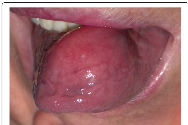
Fig. 1 Tongue fibrolipoma. Our patient presented with a swelling of the anterior two-thirds of the ventral surface of her tongue

On histological examination, the lesion showed clear characteristics of mature adipose tissue, without