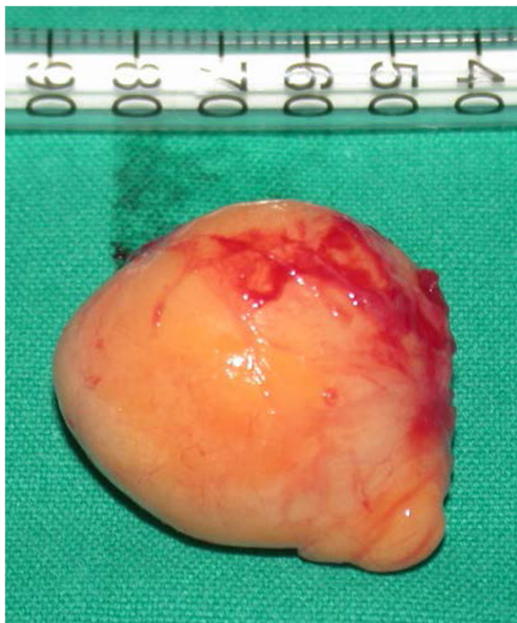
Fig. 3 Enucleated fibrolipoma. On macroscopic examination, the neoplasm appears capsulated, yellowish and soft in consistency, and 40 × 40mm in size

From a connective fibrous capsule originate multiple fibrous bands, that often adhere tenaciously to adjacent tissues and structures, with focally pseudo-infiltrating aspects that may cause doubt of a differential diagnosis with malignant infiltrating lesions.