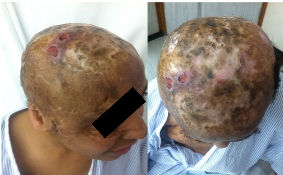
Fig. 4. post-operative result.

one case with a high voltage electrical burn injury was reported, and our case appears to be the first reported flame burn [5].