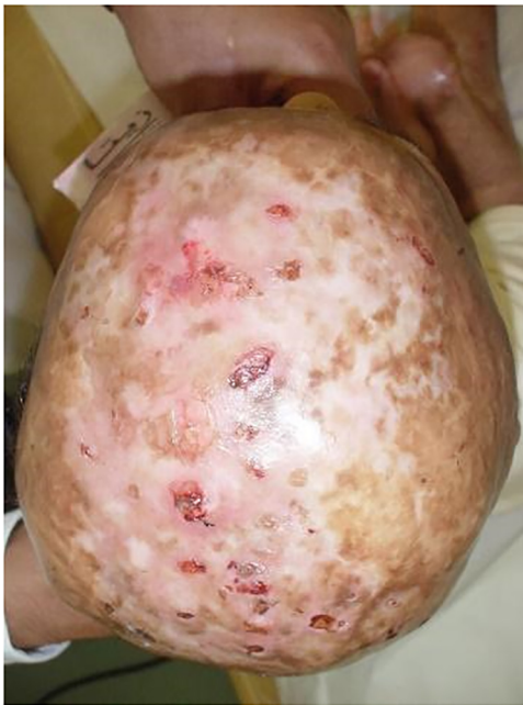
Fig. 1. pre-operative unstable skin over the scalp.

2012, the patient was admitted through the clinic due to his chronic condition of recurrent open wounds for many years.