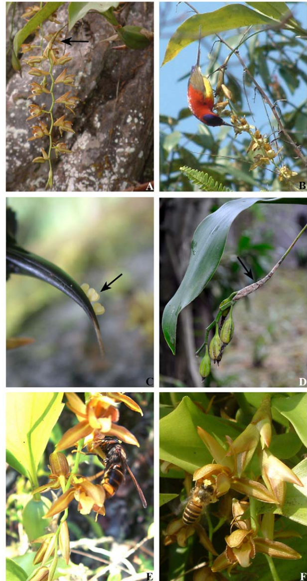
Figure 1. Sheaths surrounding the basal axis (perch) of C. rigida inflorescences attract and position sunbirds for cross-pollination to ensure reproductive success. A. Inflorescence with the sheathed bird perch (arrow). B. A bird (male) on a perch bends down to probe flowers. C. Pollinaria (arrow) attached to different spots on the bird beak are cross-transferred to flowers with equivalent distances to perch. D. Fruit set from cross-pollination. E. A wasp and F. a honeybee visit flowers in the same manner, both causing infertile self-pollination. doi:10.1371/journal.pone.0053695.g001

The inflorescence of C. rigida is pendulous, its rachis is soft, and its flowers are below the basal axis and are open horizontally (Fig. S2). Consequently, the sunbirds perching on the basal axis