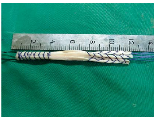
Figure 1. The single bundle four-strand graft was about 12 cm long. The four ends of the four-strand tendon were sutured with ‘2’ polyester whipstitch-style sutures separately. Its diameter was 8–9 mm

The purpose of our studies was to compare the outcomes of PCL reconstruction using autografts and allografts retrospectively. Our hypothesis was that the clinical results of PCL reconstruction using allografts were equivalent to those using autografts.