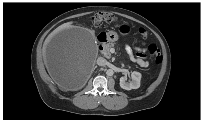
Figure 2. Initial CT showing a large fluid collection inferior to the right hepatic lobe (axial view).