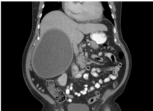
Figure 1. Initial CT showing a large fluid collection inferior to the right hepatic lobe (coronal view).

A cholangiogram revealed a low-grade leak from the cystic duct takeoff. The remainder of the biliary tree appeared normal, and balloon sweeps revealed clear bile. A 10F \times 5-cm CBD stent was placed. The patient’s abdominal