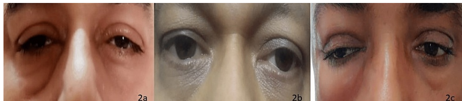
FIGURE 2: Bilateral periocular swelling in non-mucormycetes fungal rhinosinusitis in COVID-19 with delta variant

Both eyes were involved in three cases (patients 2, 5, and 6) (Figure 2). There was no acute loss of vision in any of the seven cases. The ocular evaluation demonstrated partial third-nerve palsy with normal pupillary reactions in cases 3 and 6 (aspergillosis and penicilliosis, respectively). Proptosis was not witnessed in any case. Intracranial extension with cavernous sinus thrombosis was seen in one case with aspergillosis (patient 2). RT-PCR for COVID-19 was positive in five cases, while it was negative in two cases (patients 6 and 7). Case 6 was presumed to be a post-COVID-19 patient based on the clinical history and secondary fungal infection in the context of the raging pandemic. Case 7 had in all likelihood become RT-PCR negative due to a delay in presentation of symptoms of mycosis.