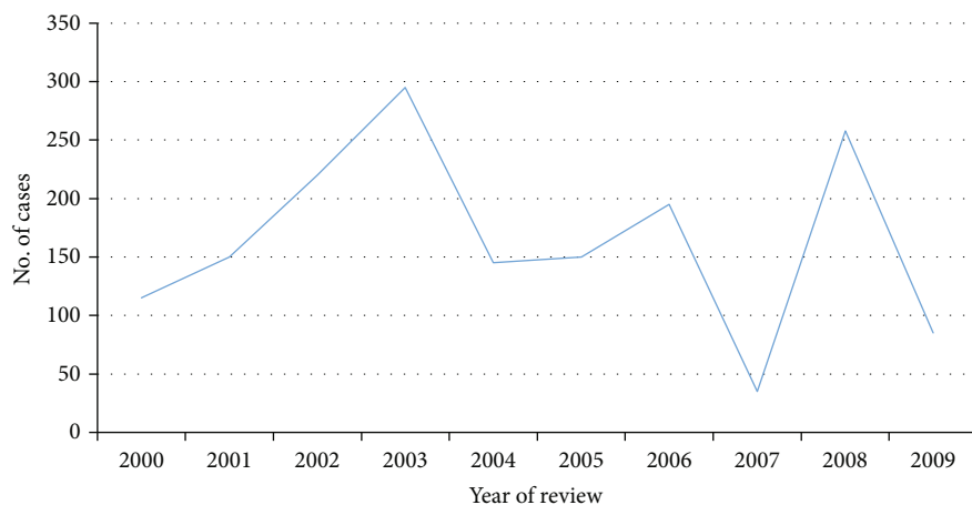
FIGURE 1: The visceral leishmaniasis trend in Kenya between 2000 and 2009.