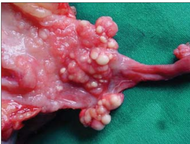
Fig. 4. Fig. 4. Same patient – after nephroureterectomy – left renal pelvis tumor pT2, G2.

Patients with UUT-TCC accounted for 6.7% of all patients who underwent surgical treatment for renal tumors in our department. Primary UUT-TCC was diagnosed in 11 patients (73.3%), whereas tumors after bladder cancer treatment were observed in three cases (20.0%).