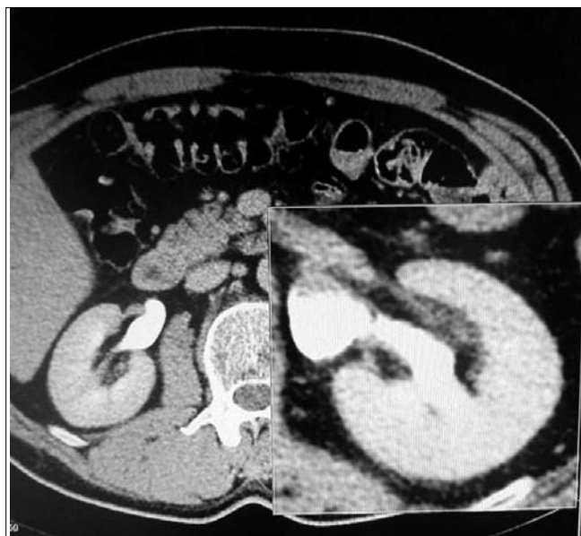
Fig. 2. Same patient-CT: left renal pelvis tumor.

The decision concerning radical or organ-sparing management was based on the overall presentation of the disease (Figs. 1 & 2). Open nephroureterectomy (O-NFU) was performed in 10/15 patients (66.7%), whereas 5/15 patients (33.3%) underwent organ-sparing