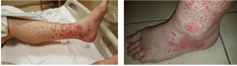
FIGURE 1: Palpable purpura on the lower extremities with ankle edema and arthritis.