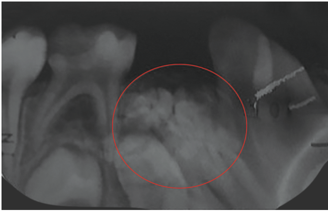
Fig. 2: IOPA showing radiopaque masses in the 83 region