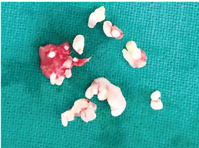
Fig. 6: Removed odontomes