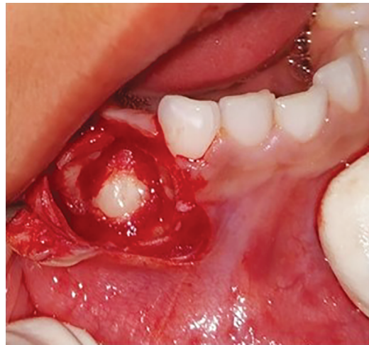
Fig. 5: Surgical site after removal of odontomes