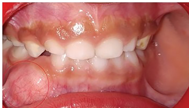
Fig. 1: Swelling on the labial gingiva of 83 region

radiograph expansion of the cortical plate was evident (Fig. 4). Based on the clinical and radiographic findings, it was provisionally diagnosed as complex odontoma. Differential diagnoses of this condition included odontoma, dentinoma, osteoblastic stage cementoblastoma and odonto-ameloblastoma, ameloblastic fibro-odontoma, ameloblastic fibroma.