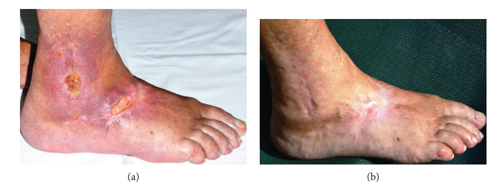
FIGURE 3: Example of successful wound healing after treatment with cold atmospheric pressure plasma (CAP): (a) chronic ulceration before CAP treatment and (b) complete healing for the first time since 14 years after CAP treatment for about 5 months.