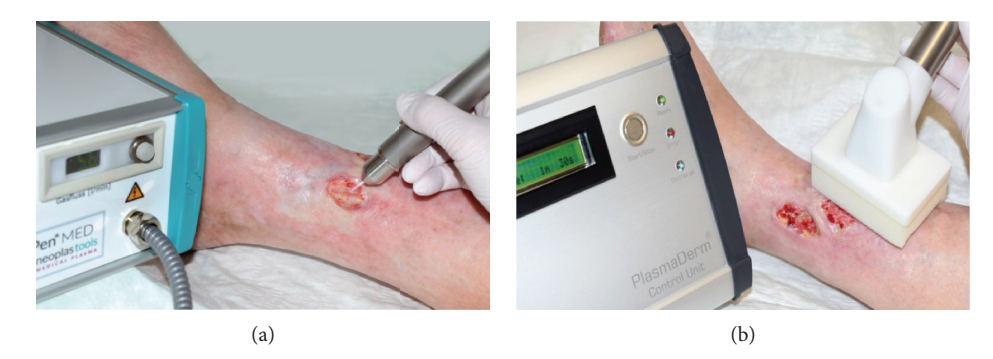
FIGURE 2: Treatment of chronic ulceration with cold atmospheric pressure plasma (CAP): (a) kINPen MED and (b) PlasmaDerm VU-2010.