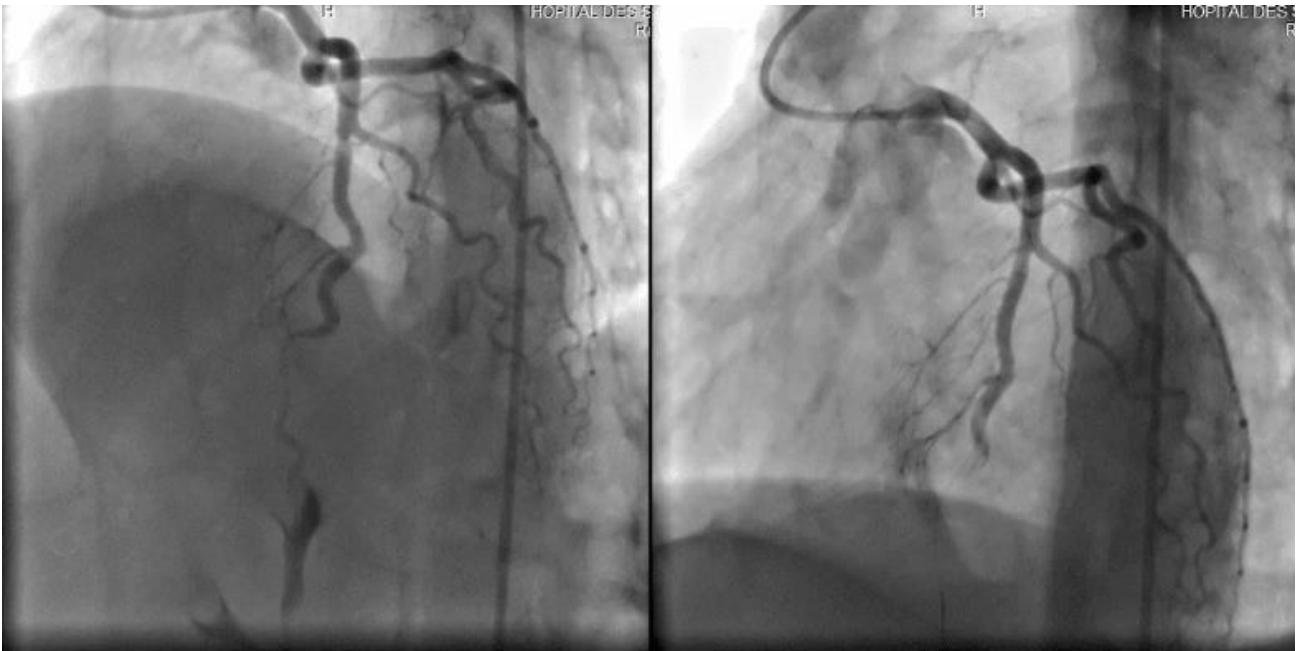
Figure 2: coronary angiography, showing a thrombus in the middle segment of the left anterior descending artery