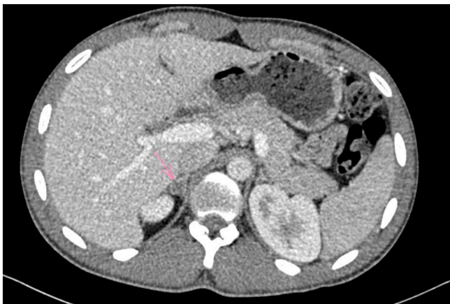
Fig. 1. Axial view of abdominal CT scan was performed and showed a right adrenal cortical adenoma.

PH as a case revealed by depression was reported for the first time in 1979 by Malinow [4]. Its prevalence is indeterminate until now.