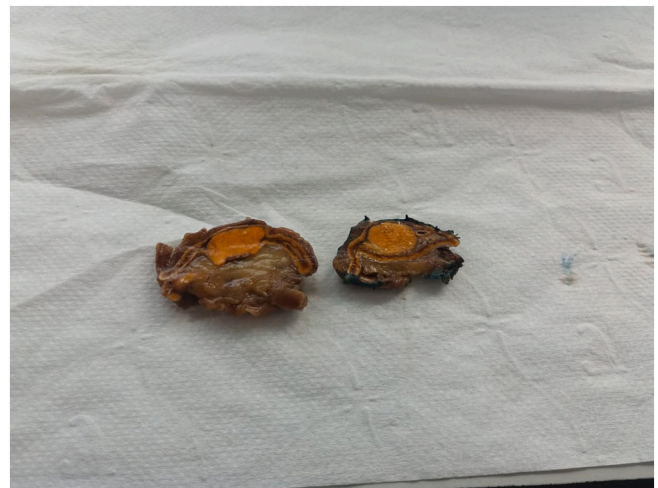
Fig. 3. Macroscopic view of the resected mass.

Initially, it was controversial that high blood pressure is responsible for these neuropsychiatric manifestations, but over time, several studies have been performed in this domain. Nicoletta et al. [6] have found that anxiety, depression and irritable mood were more frequent in PH than in essential hypertension (EH), although that the blood pressure values were similar in both cases. They noted also that hypokalemia was only found in patients with irritability. In addition, Emanuele et al. found increased plasma aldosterone levels in patients suffering from depression compared with control subjects [7].