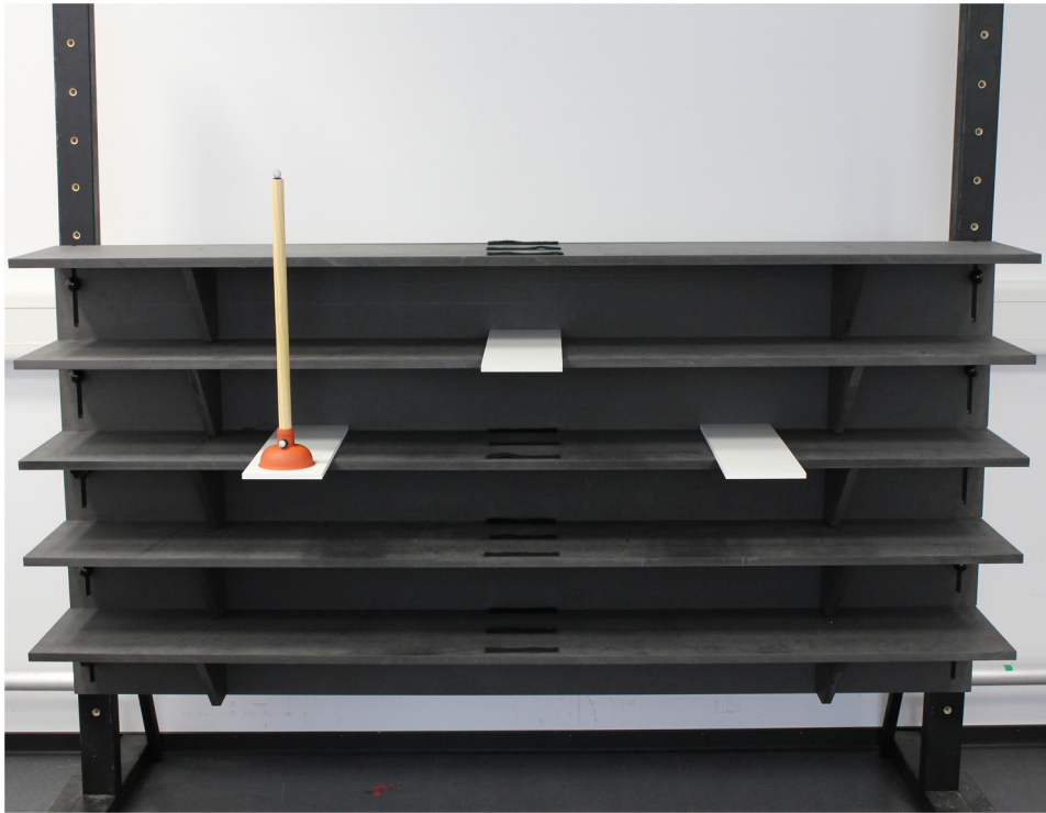
FIGURE 1 | Experimental setup.