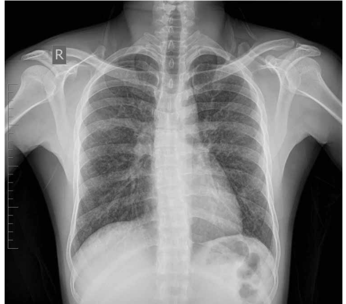
FIGURE 1 Chest radiograph.