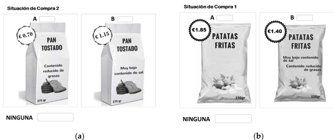
Figure 1. (a) Example of a choice set of toasted bread, and (b) example of a choice set of potato chips.

According to Scarpa et al. [51], we followed three steps to determine the choice design by performing the sequential Bayesian approach. In the pilot, we assumed multinomial probability specification to derive the design. Hence, we selected attributes and their level to derive an orthogonal factorial design. We then used the data from the pilot study to estimate a model whose coefficient estimates were then used as Bayesian priors. This last model determined an efficiency of 96.6% required by a choice design with 12 tasks. Moreover, each choice task must be structured with two different food product options (potato chips or toasted bread) and a no-buy option (Figure 1).