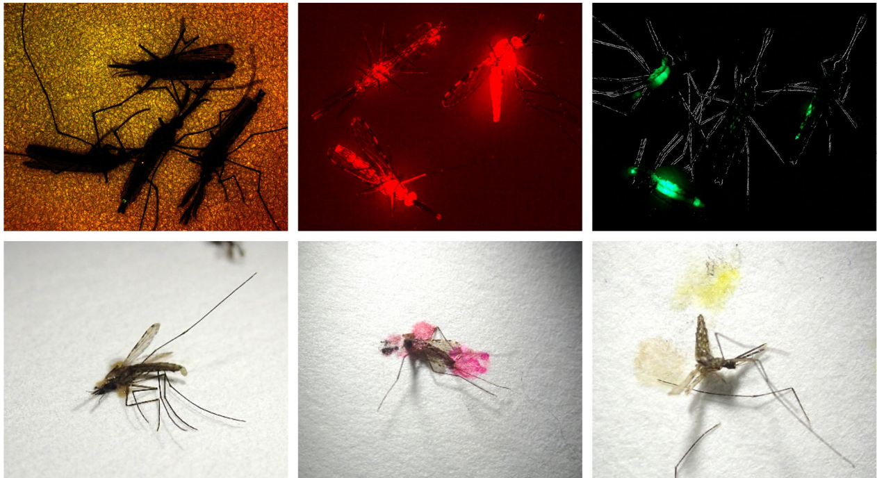
Fig. 1 Appearance of marker Anopheles gambiae adults that were unmarked (left column), marked with 0.1% rhodamine (center) or 0.2% uranine (right) were examined by fluorescence microscopy (upper row) or squashed on filter paper. Due to the low intensity of the uranine marking, the outlines of the adults were overlaid over the fluorescence image. The image of the unmarked adults was greatly overexposed relative to the marked images to make them visible