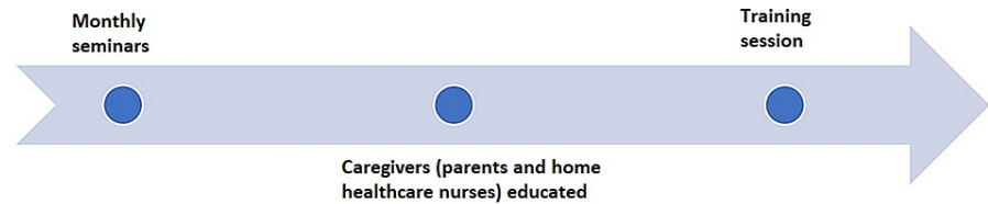
FIGURE 3: Timeline showing educational interventions during study implementation

There are several factors that could potentially contribute to the failure of successfully implementing algorithm 1 and they include presentation at odd hours, unavailability of surgical team, and unsuccessful repair of catheter at the ER. An unsuccessful ER repair is defined as when a line does not flush or draw back blood. The multiple attempts at repair involve the first repair leaking after flushing attempts and the surgeon opens a new kit to attempt repair again. Two to three attempts were typically made before the decision to admit the patient to the pediatric unit for further care. With each algorithm, it is required that the pediatric gastroenterologist is made aware of the repair to order total parenteral nutrition (TPN) for the patient upon discharge. New TPN rates may be required for that evening until the repair is fully set. After the CVC is repaired, it is not used until after six hours at which it is run at half rate as per the surgeons' recommendation. After 12 hours, it is then run at full rate.