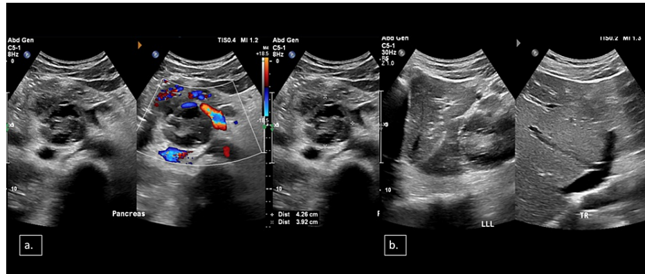
FIGURE 1: Selected axial ultrasound images of the upper abdomen

His chest radiograph was unremarkable. Initially, his abdominal ultrasound showed a heteroechoic cystic lesion measuring 4.3 \times 3.9 cm in the pancreatic head with peripheral vascularity (Figure 1a). The liver showed a coarse echotexture. Mild intrahepatic biliary radical dilatation was noted in the left lobe (Figure 1b). No focal lesion was noted. The common bile duct (CBD) was dilated, measuring 9.9 mm. No obvious stones were imaged in the visualized parts of the CBD.