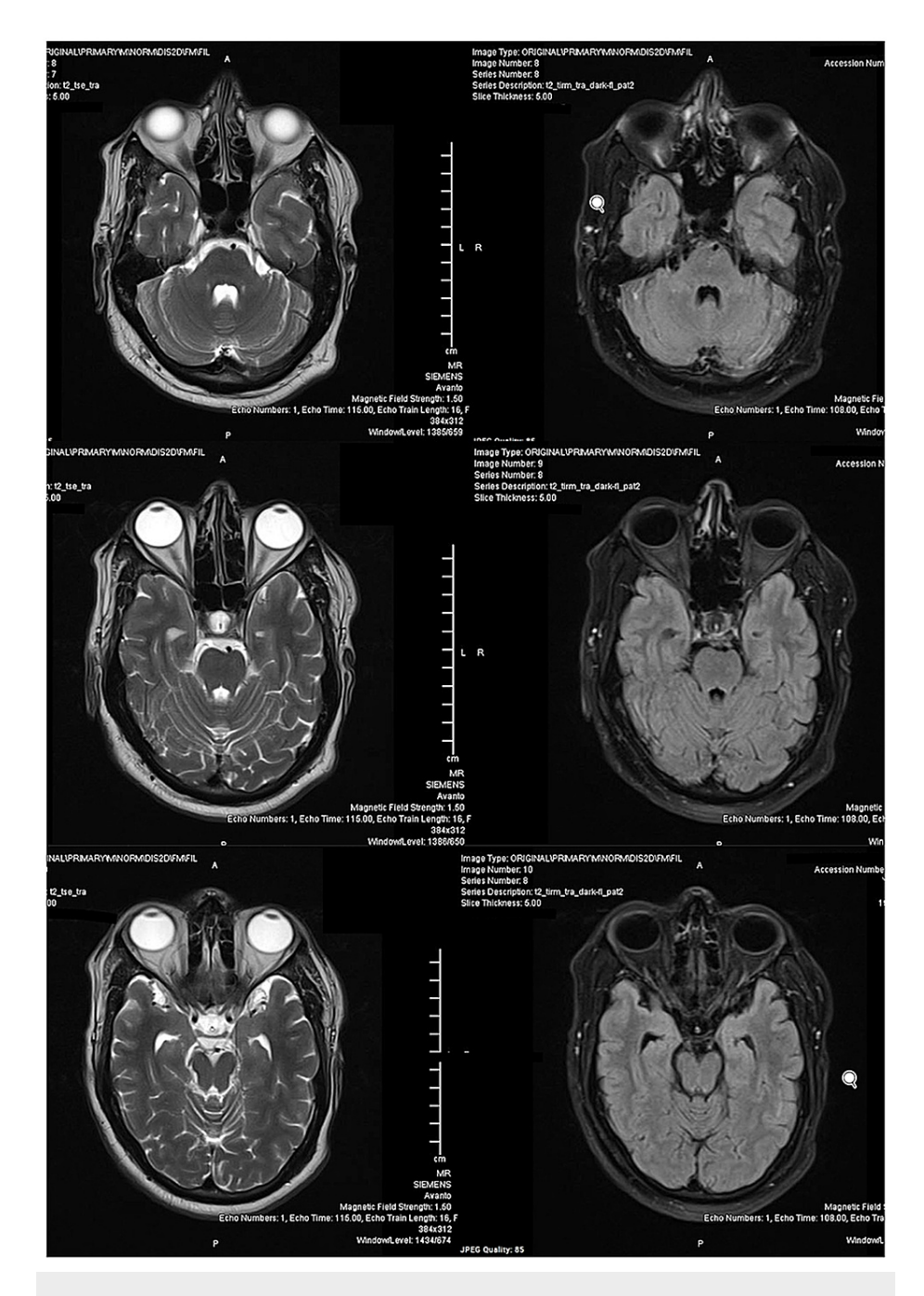
FIGURE 2: MRI brain of the patient with T2-weighted images (left) and FLAIR images (right) at the level of the pons showing no abnormality.

MRI: magnetic resonance imaging; FLAIR: fluid-attenuated inversion recovery