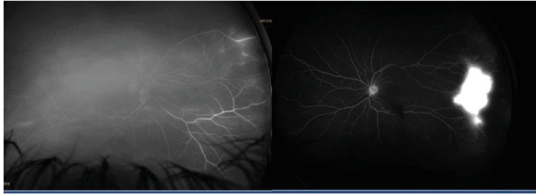
FIGURE 2: Fluorescein angiography showing peripheral vasculitis in the right eye and peripheral neovascularization in the left eye with significant leakage in temporal area.