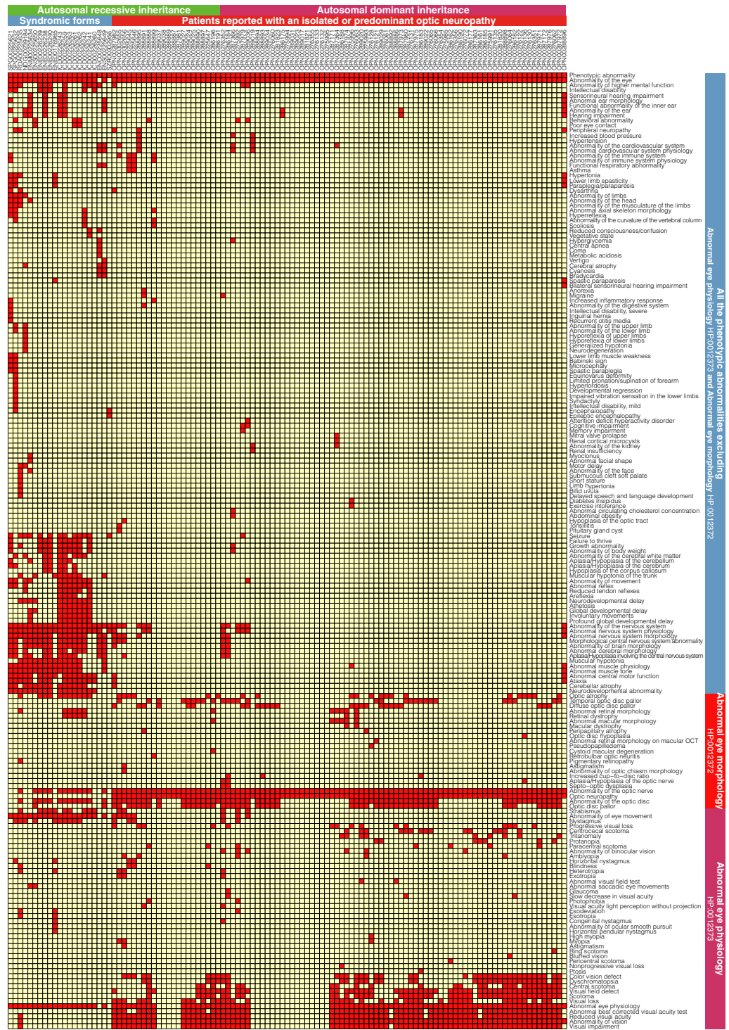
Fig. 3 Visualisation of the Phenotypic abnormality subontology (HPO# HP:0000118) annotation in the ACO2 dataset. Describing the 113 symptomatic patients’ reports with an extended set of full clinical description. Rows are clustered using hclust by separating the terms descending from Abnormal eye physiology (HPO# HP:0012373) and Abnormal eye morphology (HPO# HP:0012372); human readable shortened ontological term names were used (where possible). In columns, the identifiers of the patients (8 digits) are prefixed by code of the disease reported (3 letters): ICD: degeneration, cerebellar-retinal, infantile; RDA: dystrophy, retinal, with or without extraocular anomalies; ENM: encephalomyopathy, mitochondrial; ENC: encephalopathy; ENE: encephalopathy, epileptic; ENS: encephalopathy, neonatal, severe; NDG: neurodegeneration; OPN: neuropathy, optic; SPG: paraplegia, spastic; SZR: seizures. A red box indicates the presence of the phenotype. Data as of June 8, 2020.