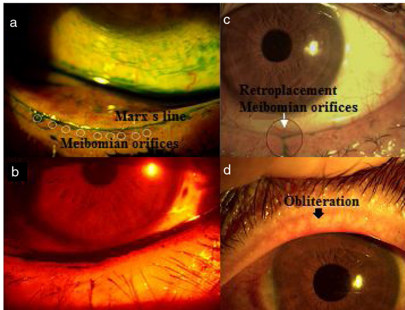
Figure 1 Lid margin. (a) Extension of green lissamine toward meibomian orifices: Marx's line; (b) red filter show irregularity of lid margin; (c) retroplacement of Meibomian orifices; (d) obliteration. The punctum of the orifice may not be visible and vascular invasion is visible.