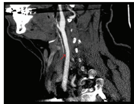
FIGURE 2: Sagittal CT angiogram of the neck (3 months later) showing very minimal mural thrombus remaining.

The severe iron-deficiency in this case was attributed to a gastrointestinal source. The patient received intravenous iron replacement and was bridged from heparin to warfarin with the aim of achieving an International Normalization Ratio (INR) of 2 to 3. He was discharged home without any deficits on low dose aspirin and warfarin as well as oral iron replacement therapy with a plan for repeat vascular