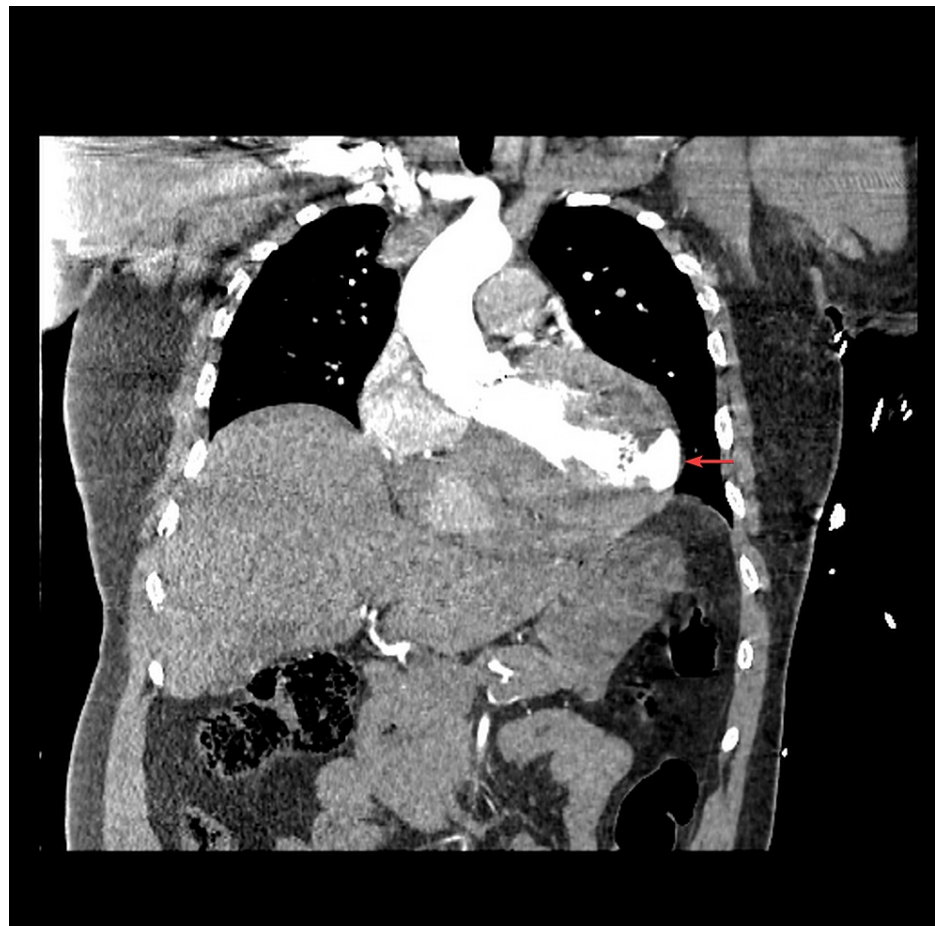
FIGURE 2: Coronal view of computed tomography with angiography of the chest showing a ventricular free wall rupture with extravasation of contrast from the left ventricle to the pericardial space (red arrow).

A computed tomography with angiography (CTA) of the chest was performed as the patient was being taken to the catheterization laboratory. This was done because aortic dissection was on the differential, given his history of AVR, and for that reason intravenous heparin was not initiated. During the cardiac catheterization, the CTA results were called in revealing a lateral free wall rupture with hemopericardium (Figures 2, 3).