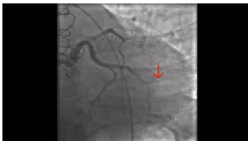
VIDEO 1: Cardiac angiography showing a cut-off of flow at the second marginal branch of the left circumflex coronary artery (red arrow), which was anatomically congruent with the area of free wall rupture.

It was then decided to limit the angiography to the preliminary coronary anatomy findings so far observed, and the cardiothoracic surgery team was made aware of the critical results. Interestingly, the preliminary evaluation revealed a cut-off of the second marginal, most likely secondary to left ventricular perforation, but the rest of the coronaries were not obstructed (Video 1). To our surprise, a “milking-like effect” was seen at the mid to distal portion of the left anterior descending coronary artery, with almost complete disappearance during systole (Videos 2, 3).