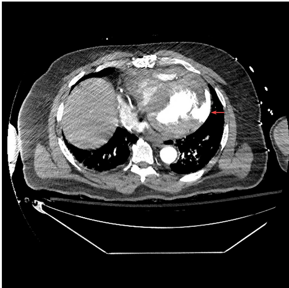
FIGURE 3: Transverse view of computed tomography with angiography of the chest showing a ventricular free wall rupture with extravasation of contrast from the left ventricle to the pericardial space (red arrow).

It was then decided to limit the angiography to the preliminary coronary anatomy findings so far observed, and the cardiothoracic surgery team was made aware of the critical results. Interestingly, the preliminary evaluation revealed a cut-off of the second marginal, most likely secondary to left ventricular perforation, but the rest of the coronaries were not obstructed (Video 1). To our surprise, a “milking-like effect” was seen at the mid to distal portion of the left anterior descending coronary artery, with almost complete disappearance during systole (Videos 2, 3).