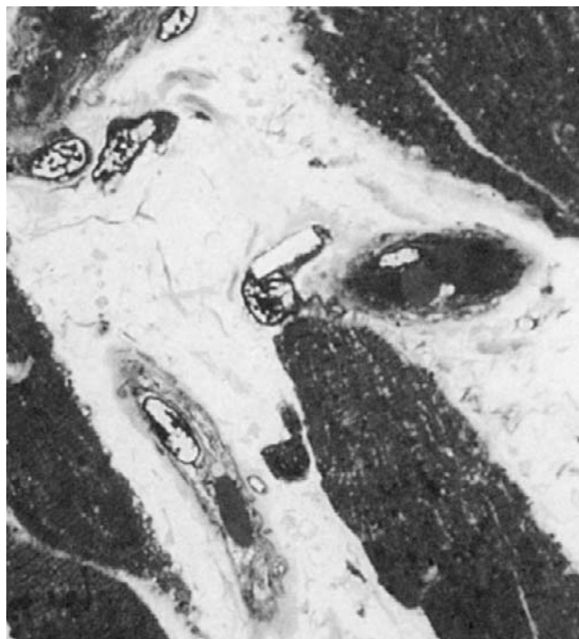
Figure 2 Myocardium with the interstitial histiocytes with rectangular cystine crystal.

Cystinosis is an autosomal recessive disorder characterized by excessive storage of cystine in several organs, including kidney, spleen, liver, lymph node, cornea and thyroid gland [1,2]. Individuals typically present in the first year of the life with symptoms of severe fluid and electrolyte disturbance, a renal Fanconi syndrome, growth failure, and photophobia. Without specific treatment, they progress to end-stage renal failure (ESRD) by end of the first decade. A rare 'late-onset' form of cystinosis presents in older children with renal impairment but not necessarily a Fanconi syndrome. Adults with 'benign' cystinosis have asymptomatic corneal cystine deposition but do not have progressive renal damage [1,2,7,8]. The diagnosis of nephropathic cystinosis can be confirmed by slit lamp examination of the cornea which reveals needle shaped, tinsel-like refractive opacities. The levels of cystine can be measured in bone-marrow cells, leukocytes, and cells of the rectal mucosa [1,2,7,8]. Renal involvement is characterized by cystine depositions in the interstitium as well as glomerular and tubular epithelium.