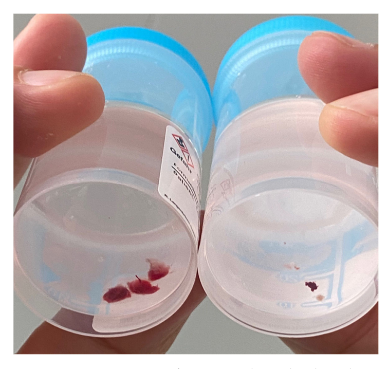
Figure 1. Macroscopic view of specimens obtained with cryobiopsy (left side) and forceps biopsy (right side).

Values are displayed as n (%) or medians \pm SD. Results were obtained according to the histologic results of pathologist 1 (P1). Abbreviations: ACR, acute cellular rejection; TBB, transbronchial biopsy; SD, standard deviation.