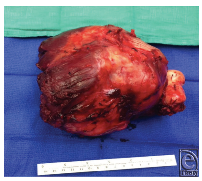
Figure 3. Intraoperative view of the myxofibrosarcoma specimen after resection.

extremity was reported in 53.8% (7/13) of studies and ranged from 0 to 60 kg. Outcomes for each individual were not provided in all studies and thus means for outcomes could not be calculated.