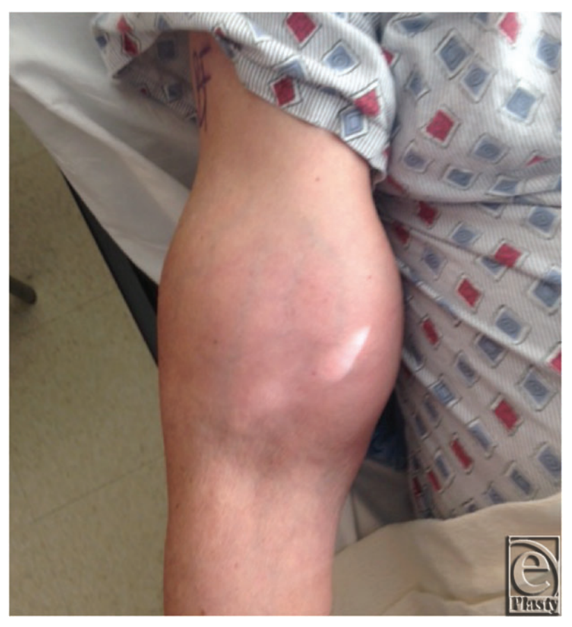
Figure 1. Preoperative view of a slow-growing soft-tissue mass of the right arm.

authors excluded studies that were focused on procedures unrelated to pedicled LD flaps to the upper extremity, including those related to free LD flaps, and those LD flaps that were not specifically intended to restore function. Studies that did not report functional outcomes were also excluded.