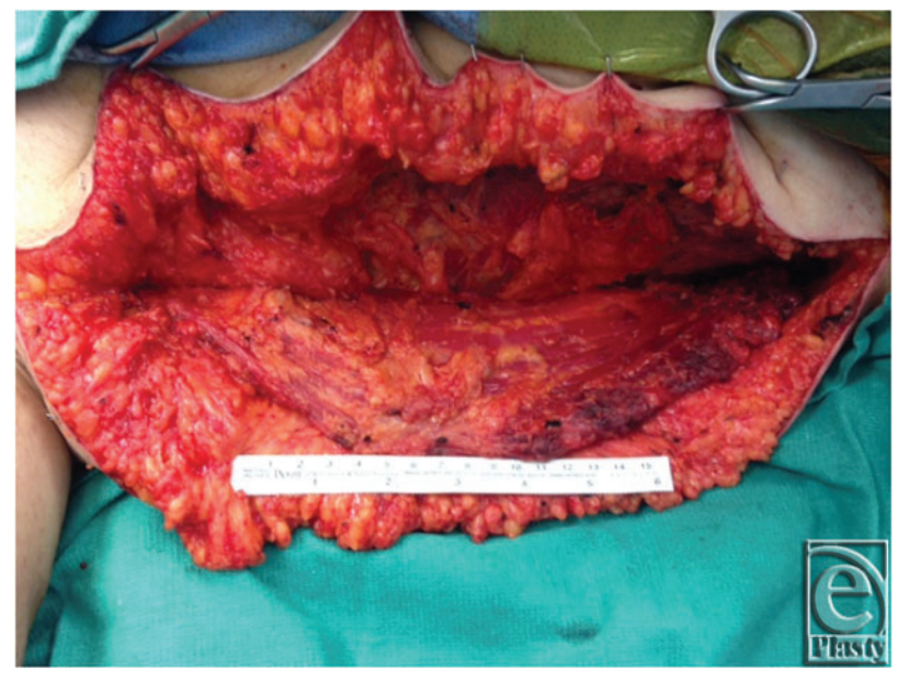
Figure 5. Intraoperative view of dissection of unipolar pedicled latissimus dorsi muscle flap.

Patients may have deficits after oncologic resection affecting a specific muscle group. Muramatsu et al^{26} presented a series of 5 patients undergoing sarcoma resection of the upper extremity resulting in complete loss of the deltoid. All patients had LD flap transfer for restoration of deltoid function. The flap was completed, raised, and detached except for the pedicle. The insertion was sewn to the deltoid tuberosity, whereas the origin was sewn to the clavicle, acromion, and spine. All patients had greater than 160° of shoulder abduction and excellent function (mean = 92% and range = 87%-93% on Musculoskeletal Tumor Society scores).<sup>26</sup> This maintenance of function is in line with prior series published on preservation of deltoid function via LD flap transfer.<sup>27</sup> Similar use of the LD flap has been used in patients with massive rotator cuff tears.<sup>28</sup>