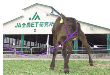
Figure 2 | A one-day-old calf produced from a chilled embryo stored for 168 h.

**Conventional freezing method 28 using LN 2 .