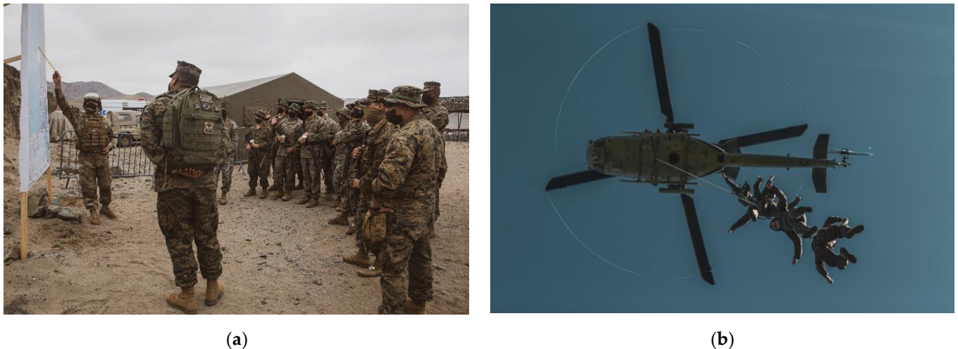
Figure 1. (a) Extensive mental and physical preparation provides the core foundation of every US Marine; (b) Tactical operations are a central function of a US Marine. Public Domain: www.dvidshub.net , accessed on 7 January 2022).

Recently, the term tactical athlete has been used to refer to service professionals of any age, gender, and race who are firefighters, law enforcement, emergency responders, and military who are physically and mentally capable of withstanding all of the physical hardship associated with their respective duties (Figure 1) [15]. The United States Marine Corps (USMC) defines a tactical athlete as any Marine who trains for combat readiness using a comprehensive athletic approach [16]. The tactical athlete incorporates strength, power, speed, and agility to help ensure their fitness level meets the requirements for combat readiness [16]. With that said, it may be reasonable to consider Active Duty Marines 40–50 years of age as tactical MA.