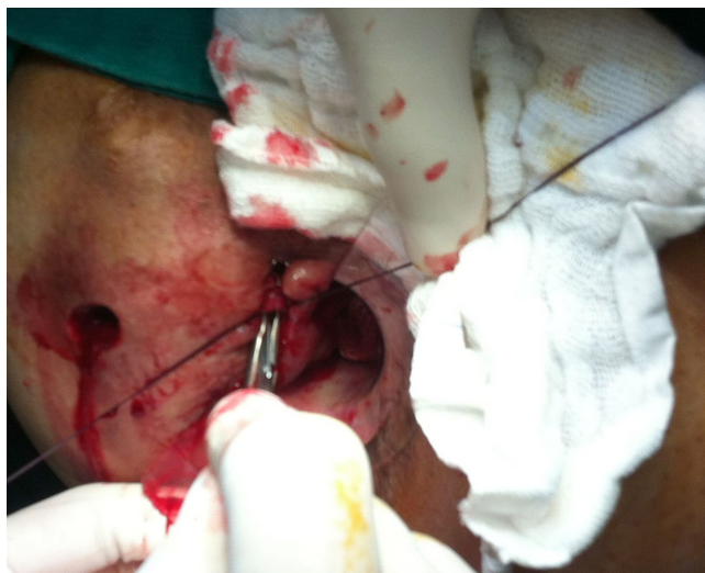
FIGURE 1 - The yarns are repairing the fistula tract: the right one next to the edge of the internal sphincter and the left is by the external sphincter

Fecal incontinence was considered in patients who were continent before the operation, but had postoperatively obvious injury of sphincter function. Patients who were discharged were instructed to return the query in case of reappearance of symptoms.