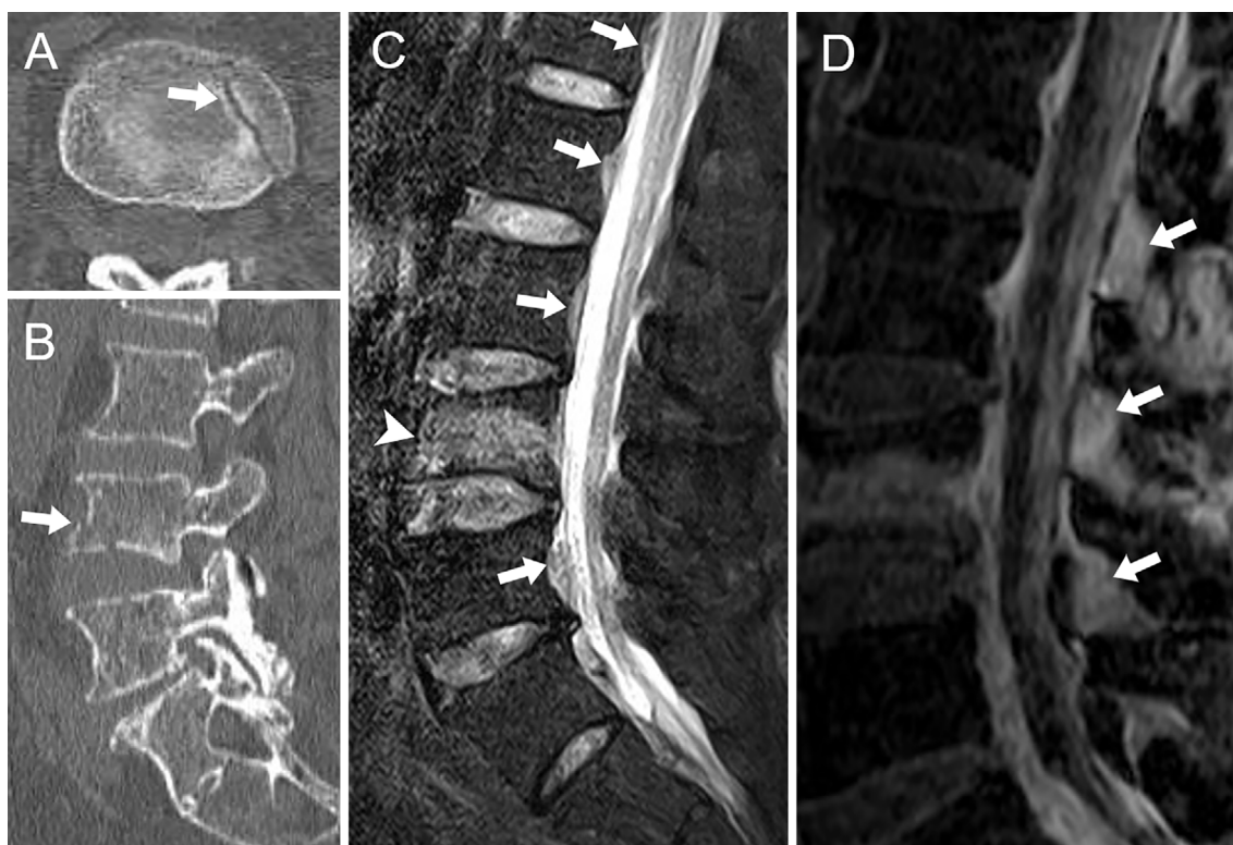
Figure 2. (A) Axial and (B) sagittal views of computed tomography scans reveal a fracture line in the fourth lumbar vertebral body (arrows). (C) Sagittal short T1 inversion recovery magnetic resonance imaging (MRI) reveals anterior epidural fluid collection at the level of the lumbar region (arrows) and a fresh compression fracture of the fourth lumbar vertebral body (arrowhead). (D) Sagittal gadolinium-enhanced fat-suppressed T2-weighted MRI reveals extravasation of fluid into the dorsal extradural fat tissues (arrows).

of blood viscosity in the venous compartment caused by reduced CSF absorption (3). Currently, more than 30 similar cases have been reported in the literature, and most of these were due to idiopathic CSF leaks at the location of cervical or thoracic levels (4). To our knowledge, this is the first report of a case of CVT with CSF leaks in the lumbar region due to a fall injury.