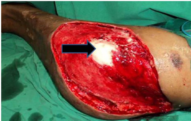
Fig. 1. Extensive soft tissue defect over the left trochanteric & gluteal region (black arrow over exposed greater trochanteric bone).