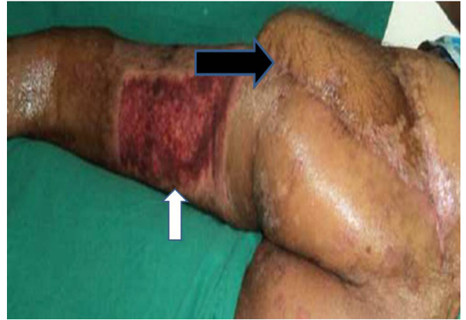
Fig. 3. Postoperative image of the flap settled well into the trochanteric and gluteal defect (black arrow) & skin graft site healed well (white arrow).

On examination, there was an extensive soft tissue defect involving the left trochanteric and gluteal region and a part of the hip and proximal femur were exposed (Fig. 1). Surgical cover of the entire defect with an extended ALT flap from the ipsilateral thigh was planned. Preoperative color Doppler of the ALT perforators revealed good signals. A flap measuring 30 cm × 10 cm was marked and raised. While raising the flap it was noticed that the LCFA had an oblique branch which had a fasciocutaneous course while the descending branch had an intra-muscular course through the vastus lateralis (Fig. 2). Therefore a decision was made to raise the flap based on the oblique branch of LCFA pedicle as a fasciocutaneous flap. The defect was covered completely with the flap and the flap donor site was covered with split skin graft. Postoperatively there was a minimal flap tip necrosis and focal areas of skin graft loss healed completely (Fig. 3). Patient was on regular follow-up and was able to perform activities of daily living and had a full range of movement of hip and knee joint.