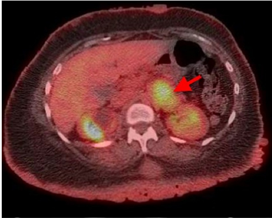
FIGURE 2: PET/CT demonstrating a mass (4.9 cm × 4.0 cm) in the medial aspect of the left kidney with hypermetabolic activity in the range of metastatic disease.

A subsequent CT scan performed four months later demonstrated a left adrenal mass with heterogeneous contrast enhancement, which had increased in size (5.5 cm × 3.9 cm to 6.0 cm × 4.0 cm) since prior imaging. The patient developed worsening left-sided abdominal pain, which was uncontrollable with pain medications. At that time, the surgery team was consulted for evaluation and management of the mass.