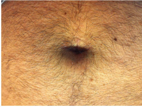
FIGURE 3: Transumbilical incision one month after surgery.