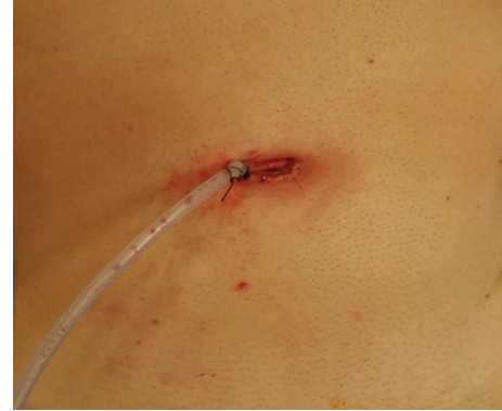
FIGURE 4: Drain through a periumbilical incision.

obtained. Medium size of the incision was 3,25 cm (range 2,5–5,2).