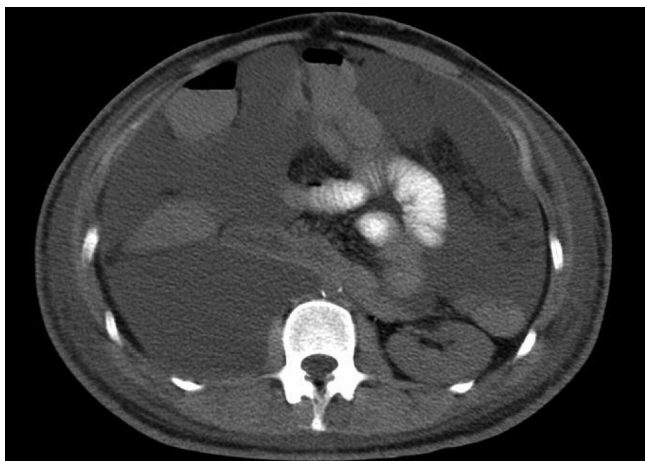
Figure 1. A CT scan of the abdomen with an oral contrast agent, demonstrating marked intra-abdominal lymph leakage postoperatively with organ compression and abdominal compartment syndrome.

paralytic ileus, pleural effusions and respiratory failure, and was transferred to the intensive care unit for elective intubation, ventilatory support and chest tube drainage of the pleural effusions (Figure 2).