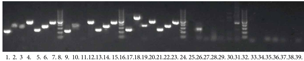
FIGURE 1: PCR products of all tested AZFa region markers. 1000 bp ladder was used as the size control (lanes 8, 16, 24, 32). Lanes 1–7: Patient's DNA sample. Lanes 9–15: DNA sample of the father of patient. Lanes 17–23: Positive control (healthy male without AZF deletions). Lanes 25–31: Negative control (male with full AZFa deletion). Lanes 33–39: No template control. For each sample, PCR products representing the tested markers are shown in following order: sY85: lanes no. 1, 9, 17, 26, 33; sy84: lanes no. 2, 10, 18, 26, 34; sY1323: lanes no. 3, 11, 19, 27, 35; USP9Y-44: lanes no. 4, 12, 20, 28, 36; sY87: lanes no. 5, 13, 21, 29, 37; sY1234: lanes no. 6, 14, 22, 30, 39; DDX3Y-16: lanes no. 7, 15, 23, 31, 39.