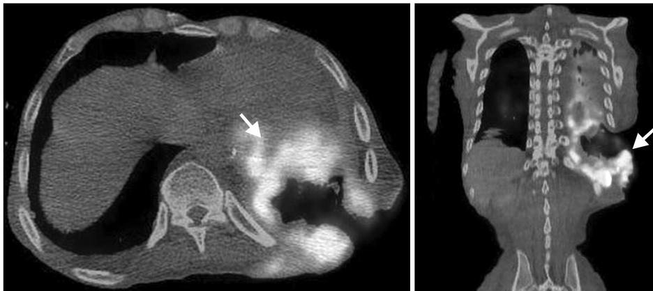
Fig. 1. Whole body PET-CT reveals the hypermetabolic lesions in left lower chest wall around Eloessor open window with widely direct invasion to pleural cavity and left lower lung.