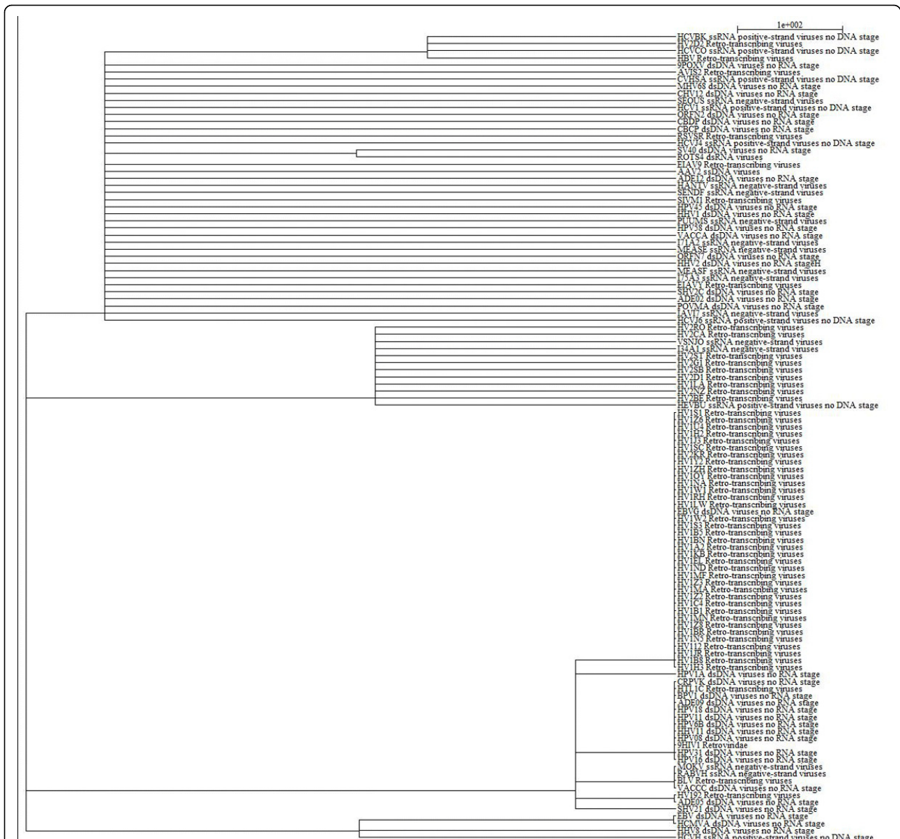
Figure 1 Virus relationship tree based on molecular function. 114 viruses are shown here. The name of each item is composed of two parts. The first part is the UniProt ID of a virus, and the second part of the item name is the basic information of the virus. The length of each branch represents the distance between distinct viruses.

interact with the human protein that has the GO annotation Dynein light chain 1 (DYL1_HUMAN), cytoplasmic, while the protein (VA36_VACCC) of VACCC, which is a double-stranded DNA virus, also interacts with the similar human protein (KLC2_HUMAN, Kinesin light chain). All of the interactions in our network are from Dyer et al. (23) and Pathogen Interaction Gateway, which were experimentally supported. The functional similarity of the target human proteins might narrow the distance of different types of virus. These results may indicate the relationship between viruses of