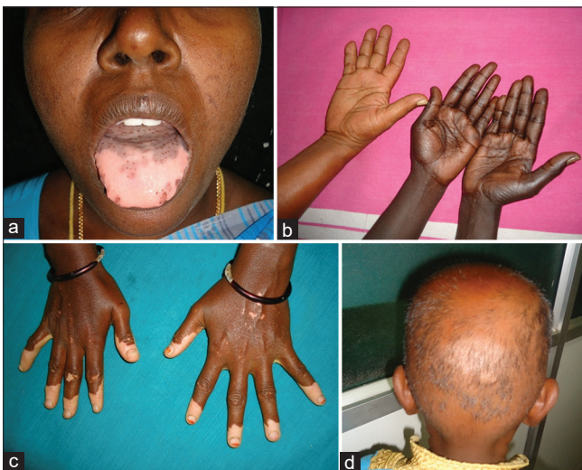
Figure 2: (a) Mucosal pigmentation. (b) Hyperpigmentation over the palm and skin crease along comparison with sibling. (c) Vitiligo with hyperpigmentation in AAD. (d) Alopecia in APS Type 1