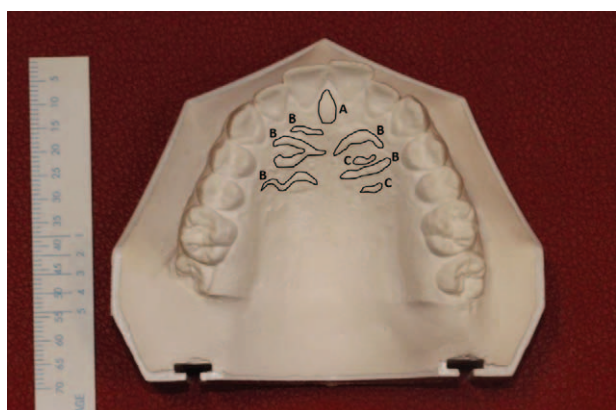
Figure 2. Palatal rugae anatomic landmarks: (A) incisive papilla, (B) primary palatal rugae, (C) secondary palatal rugae.