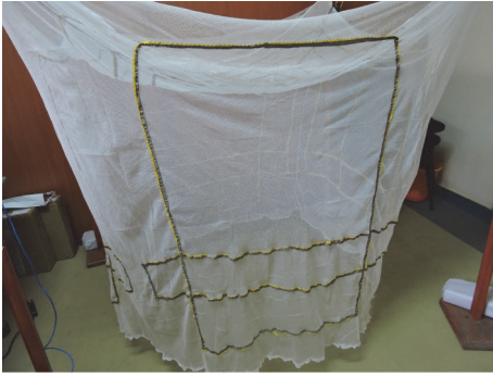
FIGURE 1: Side view of SmartNet.