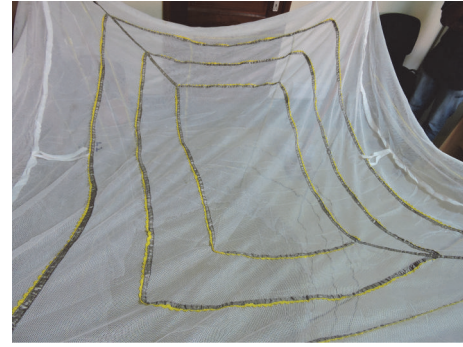
FIGURE 2: Top view of SmartNet.

Compared to asking individuals or household representatives about their bednet use, more objective means of measuring bednet use have been attempted but are problematic. Spot checks during sleeping hours [17–19], while the most accurate, are invasive and unlikely to be acceptable to most populations. Visually confirming that bednets are mounted above sleeping areas in households [20–24] is also invasive, requiring entry into households, and does not ensure that a bednet is actually being unfurled at night.