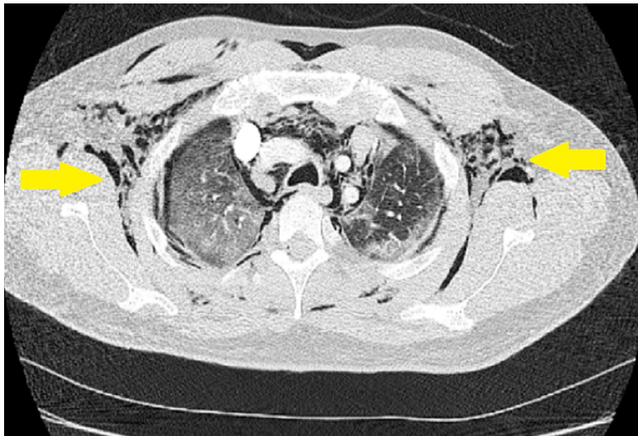
FIGURE 1: Chest CT axial section of pulmonary parenchymal window showing subcutaneous emphysema (yellow arrows) and extensive ground-glass opacities in the lung parenchyma.