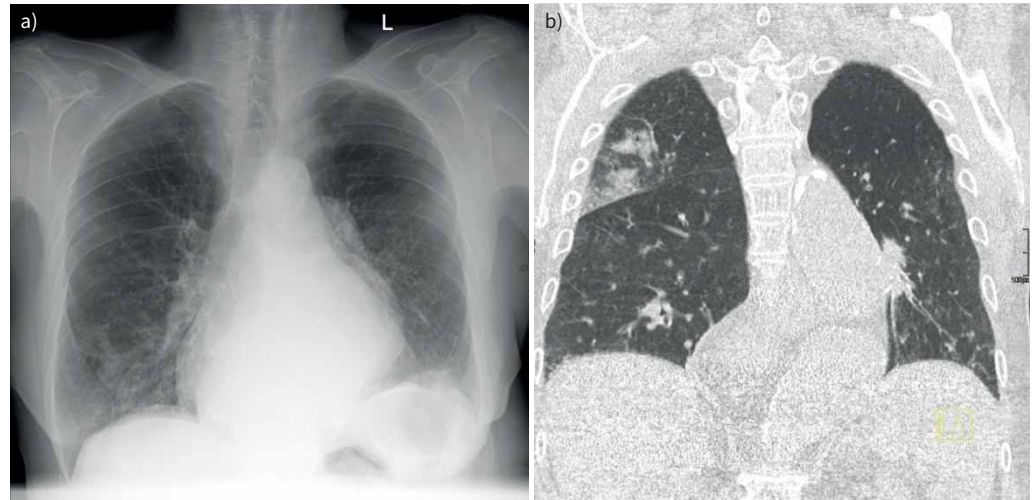
FIGURE 2 A 79-year-old female presented to our emergency room with symptoms of acute exacerbation of COPD. a) Conventional chest radiograph without evidence of radiological abnormalities; b) low-dose coronal plane computed tomography of the same patient with alveolar consolidation of the right upper lobe.