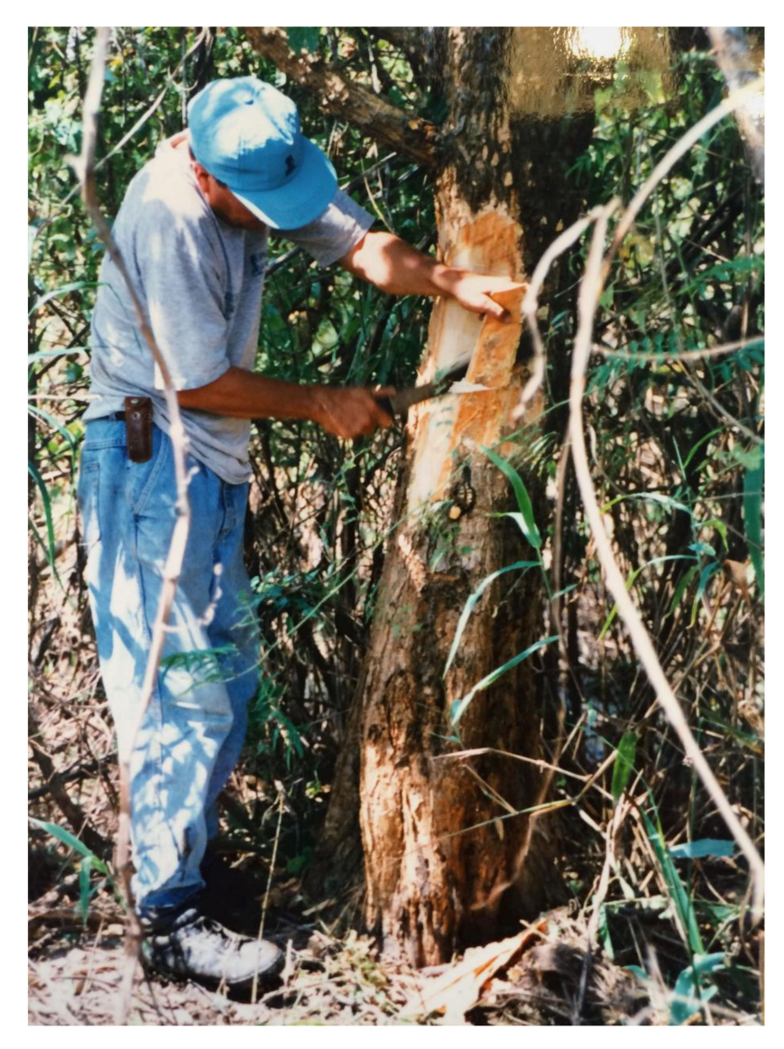
Figure 4. Harvesting the bark of an identified tree for medical purposes. The bark was suspended in boiling water for several hours and the extract was applied externally overnight for treating a skin infection in the author's foot. 1995. Llanos de Moxos, Bolivia.

A fixed-dose preparation of quinidine sulphate and dextromethorphan hydrobromide (Nuedexta) is the first treatment approved in the United States and in Europe for pseudobulbar affect, a neurological disorder characterized by uncontrollable episodes of exaggerated emotional expression that occurs in adults with neurological damage conditions [53]. In this combination, low-dose quinidine is utilized to inhibit the metabolism of dextromethorphan by cytochrome P450 (CYP) 2D6, thus increasing the plasma (and brain) concentrations of dextromethorphan. Dextromethorphan is an agonist of CR-1 receptors in brain regions associated with emotions [54].