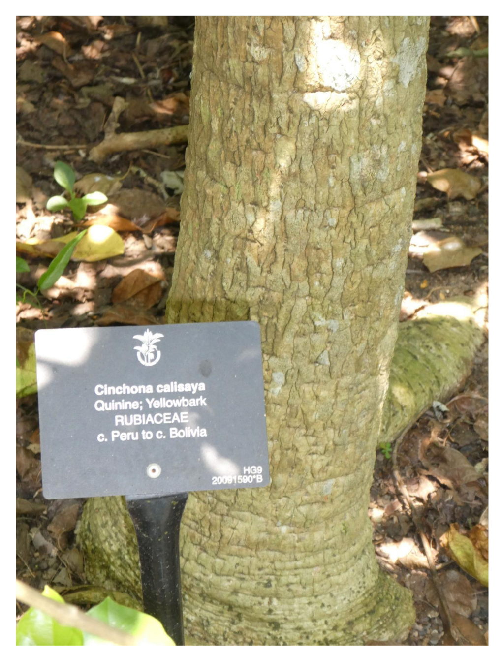
Figure 1. Cinchona calisaya. 2018. Photo by the author, Singapore Botanic Gardens.

The complexity of cinchona alkaloids made their chemical synthesis challenging. Quinine and quinidine have heterocyclic structures, with four chiral centers and thus 16 stereoisomers (Figure 2). In 1918, Paul Rabe and Karl Kindler published a method for the final steps in the synthesis of quinine (and quinidine) [10], but their work has become the subject of a 90 year-dispute [11]. In the mid-1940s, Robert Woodward and William Doering reported on a 17-step 'total synthesis' of quinine to yield d -quinotoxine [12,13], from which only three final steps were required to obtain quinine, according to Rabe's work [14]. Woodward's and Doering's synthesis was disputed as well, especially by Gilbert Stork, who was in 2001 the first to report on stereoselective total synthesis of quinine [11,15]. In 2007, Robert Williams repeated Rabe's reaction under 1944 conditions and obtained quinine, thereby demonstrating that the total synthesis of quinine by Woodward-Doering and Rabe-Kindler was indeed possible [16].