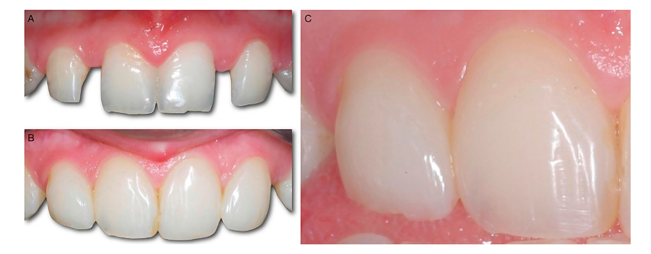
Figure 6. 20-year-old man at the end of orthodontic treatment. The frontal sector shows small teeth, and large diastemas ( A ). To meet the aesthetic needs of the patient, it was necessary to enlarge the teeth with intrasulcular restorations, and to recreate the contact points that allowed the papillae to close the unsightly black triangles ( B ). Although the patient does not maintain optimal oral hygiene, the gingival tissues are in excellent health ( C ).