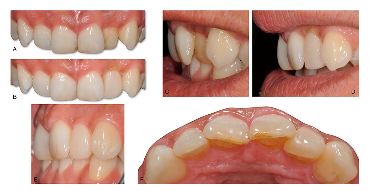
Figure 7. A 37-year-old woman. The 2.2 is tilted towards the palate ( A , C ). This tooth, set back compared to the other elements of the front group, is more difficult to manage in home hygiene. Even the self-cleansing mechanisms work worse, and for these reasons, the tooth quickly becomes darker, and creates great discomfort for the patient, who is not willing to undergo orthodontic treatment. The BAIR technique represents an alternative, quick, and possibly reversible solution, with no biological cost, and an immediately visible result ( B , D ). It is possible to obtain a remarkable change of the emergence angle in the intrasulcular portion of the restoration, which allows for the reshaping of a lateral incisor congruent with the contralateral one. The follow-up shows a stable result ( E ), and the treated tooth shows an increased thickness ( F ) that does not cause any discomfort for the patient (it should also be considered that the occlusal relationships have not been modified).

Regarding intrasulcular restorations, there is conflicting evidence in the literature on whether these restorations can cause periodontal damage or inflammation [7–12]. The results of this study show that, if the restorations were carried out following the indications, they find a good integration with the soft tissues, without causing gingival inflammation. In the monitored time interval, none of the probed sites exceed the PD > 3.5 mm threshold value. The gum does not show any clinical signs of inflammation, nor any kind of "discomfort" is reported by the patients themselves. The periodontal values recorded at the end of the observation period are comparable to those of the adjacent untreated tooth.