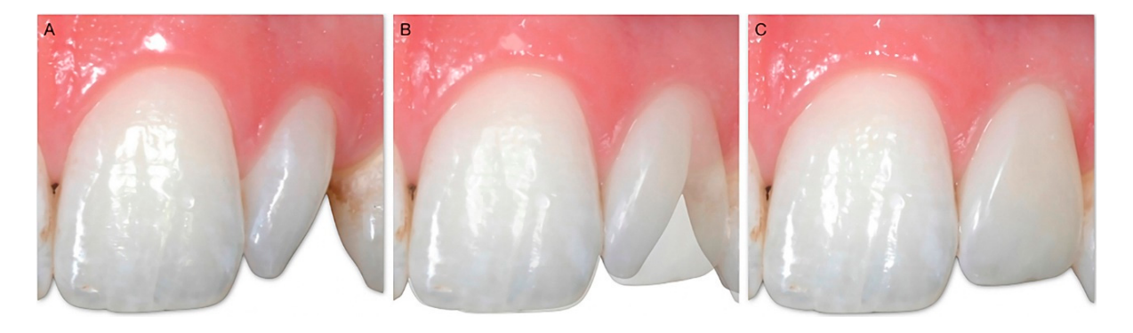
Figure 4. ( A ) A peg-shaped upper left lateral incisor. ( B ) The patient was treated using the BAIR technique. The volume of composite added to restore a shape similar to a normal lateral incisor can be seen in transparency. ( C ) The final result.