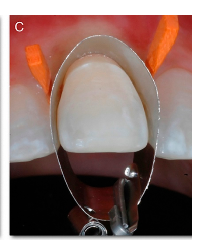
Figure 1. ( A ) The matrix is positioned around the tooth, tilted and pushed in the cervical direction, held adjacent to the tooth, and slid apically to fit the gingival sulcus. ( B ) In this way, it is possible to obtain an isolation of the operative site, and an easy application of the adhesive and composite. ( C ) It is possible to modify the emergence angle, and reconstruct a new "artificial CEJ".

Patients were monitored for about two years, and data collection was made before performing the BAIR technique (T0), immediately after therapy (T1), and at a subsequent follow-up after about two years (T2).