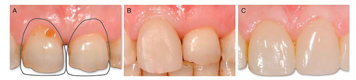
Figure 3. (A) A woman in her 50s with worn incisors, and misaligned gingival parables. 1.1 shows root exposure with caries. To solve the aesthetic problem, and "rejuvenate" the smile, it is necessary to enlarge the incisors to close the diastema, align the gingival parables, and find the right proportions. The traditional treatment plan involves surgery to achieve the lengthening of the clinical crown followed by a prosthetic phase. This case was treated in a single session with the BAIR technique. (B) Intermediate stage where we can see the 1.1 restored. By changing the emergence profile, and rebuilding a new artificial CEJ more apically, we can obtain the necessary lengthening. (C) BAIR restorations finished. The gingival tissues immediately adapted to the new design of the restorations.

The goal of the technique is to change the emergence profile of the tooth by performing intrasulcular restorations. Through the creation of a new "artificial CEJ", it is possible to modify the angle between the root and the crown both on the vestibular–palatal and on the mesio-distal plane. These changes allow us to guide the positioning of the soft tissues, which are supported by a sort of "shelf" represented by the restoration itself. This allows us not only to change the length of the clinical crown (Figure 3), and correct defects of the shape or structure (Figure 4), but also to harmonize the design of the gingival parables (Figure 5), to close diastema spaces (Figure 6), and to allow for a "virtual" modification of the inclination of the dental axes to improve the smile, and harmonize the gingival profile (Figure 7).