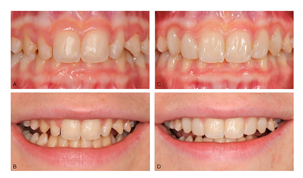
Figure 5. ( A ) 16-year-old girl at the end of orthodontic treatment. There is a noticeable disharmony between the size of the central incisors and those of the lateral incisors and canines ( A ). There are also diastemas that the patient does not like, and which make the smile unpleasant ( B ). In a single session, without the need to give anesthetic, it was possible to enlarge the microdontic teeth, close the diastemas, correct the vestibular inclination of 2.3, and, at the same time, give a better balance to the gingival parables ( C ), thus obtaining a more pleasant smile ( D ).