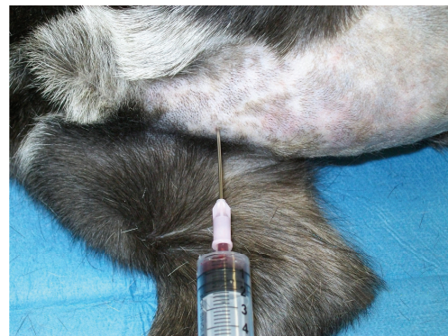
FIGURE 2: Bone marrow aspirate with the dog positioned in right lateral recumbency.

megakaryocyte number. For each dog 3 appropriated slides were considered, and all of them were scanned using a high microscopic magnification (100x) to determine a complete 500 cell differential counts, the myeloid to erythroid ratio calculation, and the final interpretation of the cytologic findings. Parasitological examination was performed with the same magnification objective to show the presence of Leishmania amastigotes within macrophages or free in the extracellular environment, after the macrophages membrane destruction. Parasites count was done using the technique described by Chulay and Bryceson [9]. To avoid false-positive results a total number of 5 amastigotes per slide was considered as positive result.